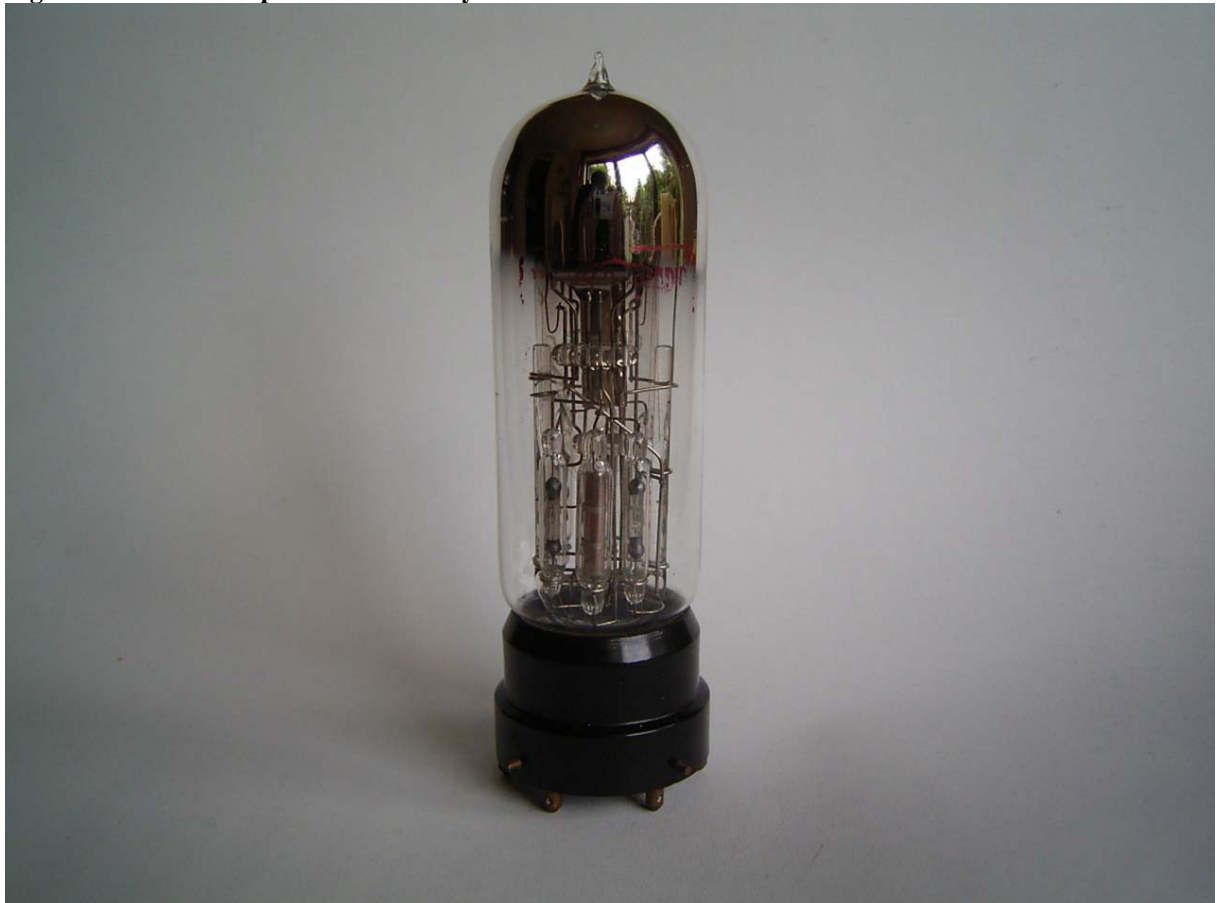
Fig. 16: Multiple Tube 3NF Made by Loewe, containing three tube systems, condensers and resistors