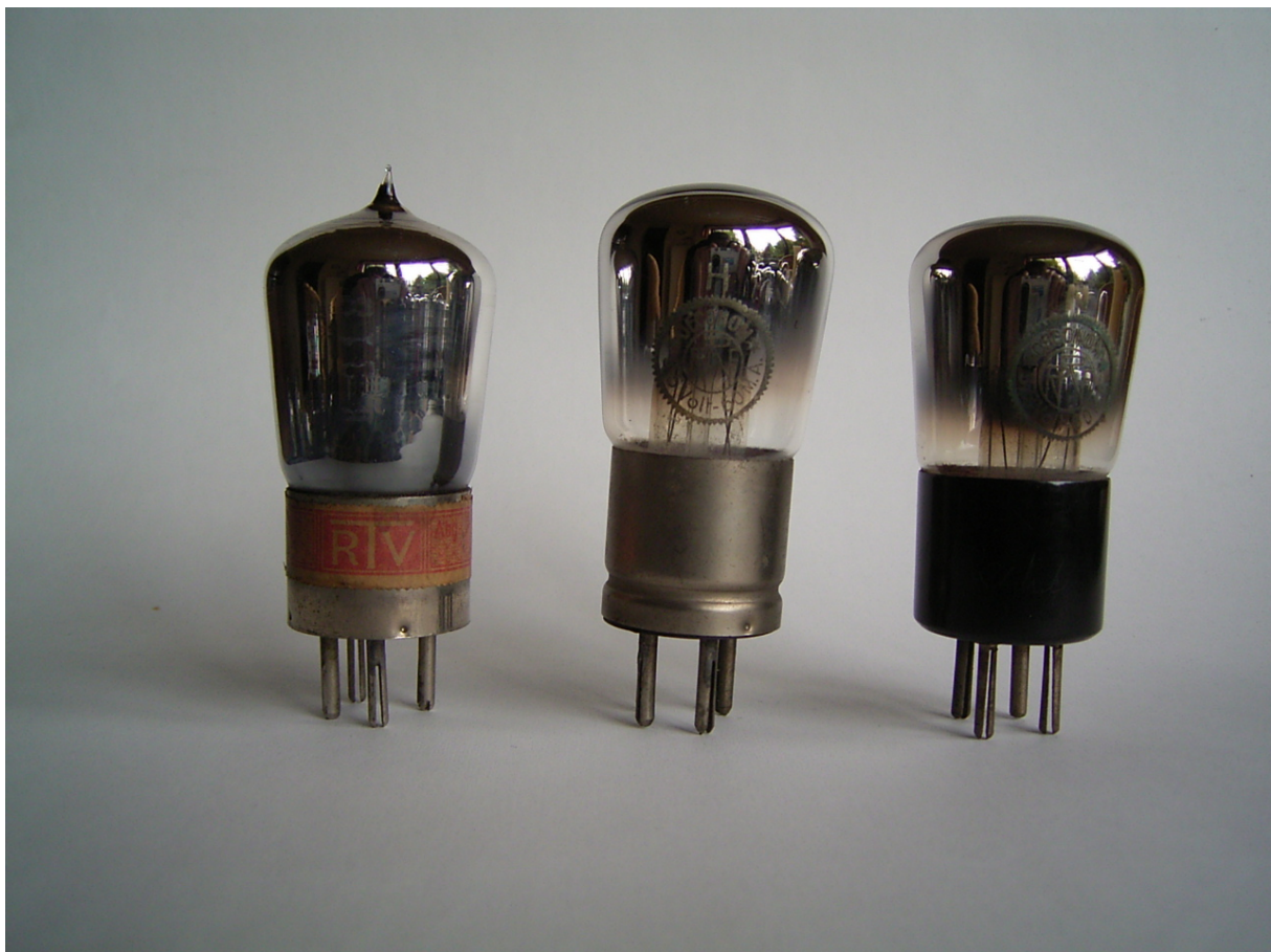
Fig. 5 Specializing of Tubes According to Circuit Demands

(Comparable types were e.g. the „UV 201“ by Radio Corporation of America, the D II by Philips, the R5 by Societe Francaise Radioelectrique or the A.R. by Ediswan)