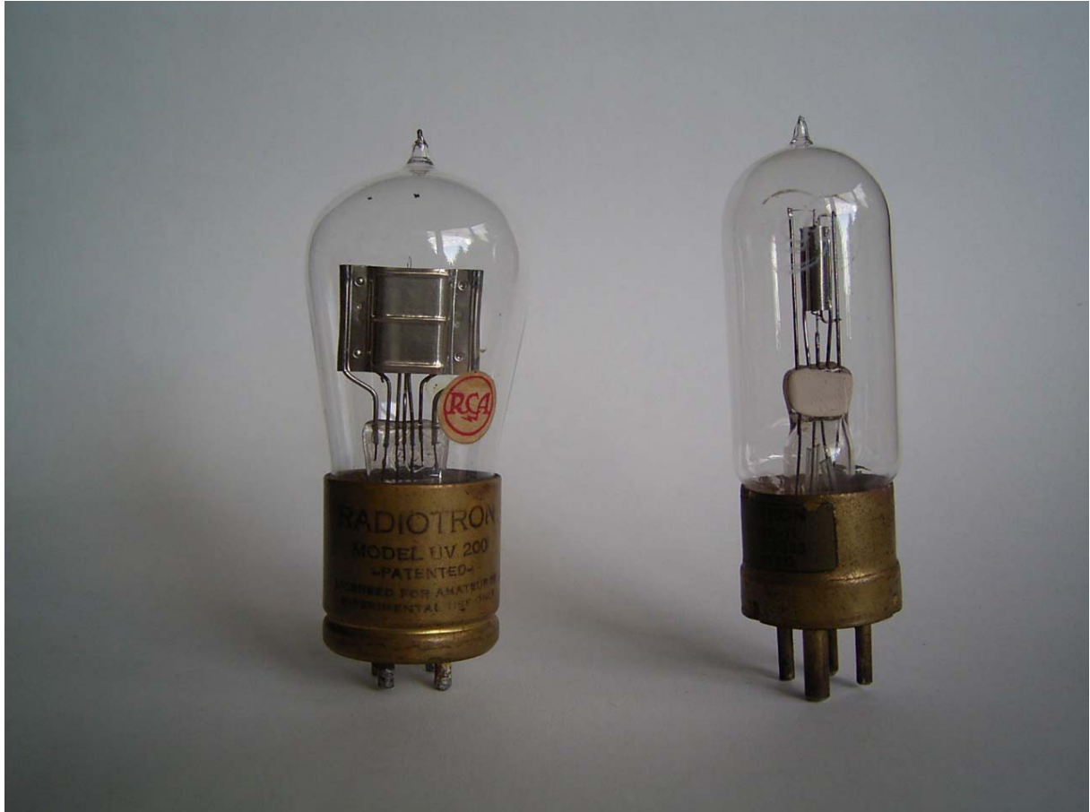
Fig. 2: Examples of the Beginning of the Radio Era Tubes

The radio era started – e.g. in the US in about 1921, in Germany in 1923 - with tubes for general application according to the state of the art, which means they had either pure tungsten or oxide coated filaments and a system either tubular or more plane. This results in basically four types. Fig. 2 shows examples of the Radio Corporation of America