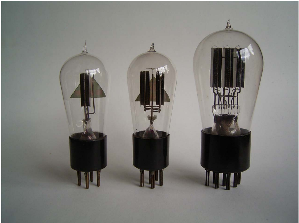
Fig. 15: A Set of Multiple Tubes made by TeKaDe