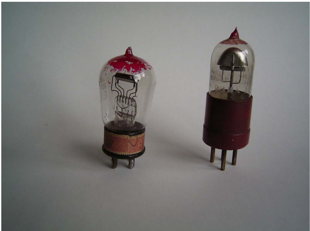
Fig. 4: Selected Tubes with Colour Markings

At first tubes suited for a special application were selected from a whole batch by measurement and then marked by colour. Fig. 4 shows an R.E.84 by Telefunken, marked with red colour (which meant best suited for detector application) and a Cossor P2, marked with red colour too (which meant best suited for high frequency stages [3])