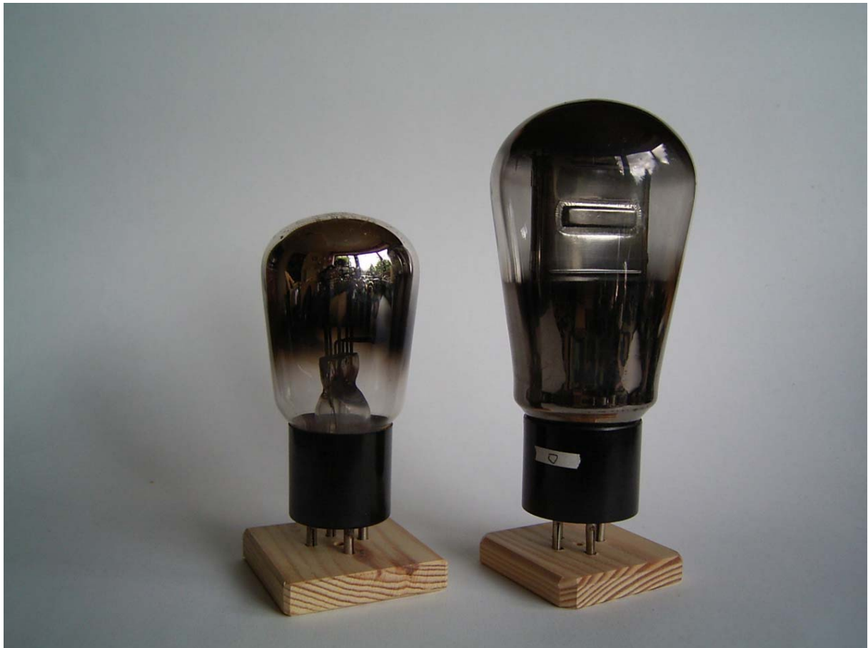
Fig. 10 Dark Emitter Output Tubes

The surplus amount of barium gave a barium deposit inside the glass bulb on the places opposite to the openings of the electrode assembly (Fig.10), acting as the getter. So dark emitter tubes can be recognized by this new getter look.