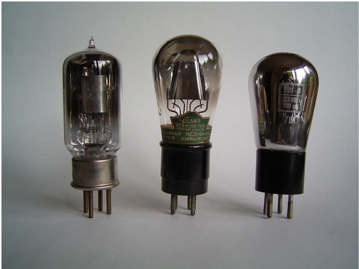
Fig. 7: Output Tubes with Thoriated Tungsten Filament

From the left: Telefunken „RE 209“, Cossor „Stentor two“, Valvo „201B“