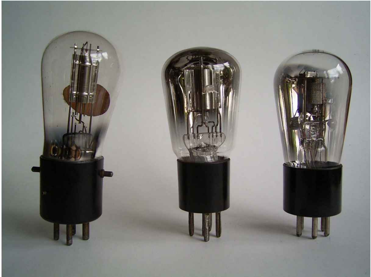
Fig. 12: Indirectly Heated Tubes for Mains Operation

The desire to get rid of the batteries led to the development of tubes which could be heated by the mains supply. The difficulty to take filament supply from mains was the fact that mains was mostly AC-mains, causing the mains hum in the circuits. To gain freedom from hum, the electron emissive layer must be free of thermal or electrical influences of the mains frequency. The way which had to be gone to reach this goal was long (one intermediate step were the short filament tubes, one error were the Telefunken bar tubes). The final solution was the indirectly heated cathode, where the filament was only the heater for a nickel tube which was coated by the electron emissive layer, mostly a paste of barium oxide. These tubes were introduced in 1927, too.