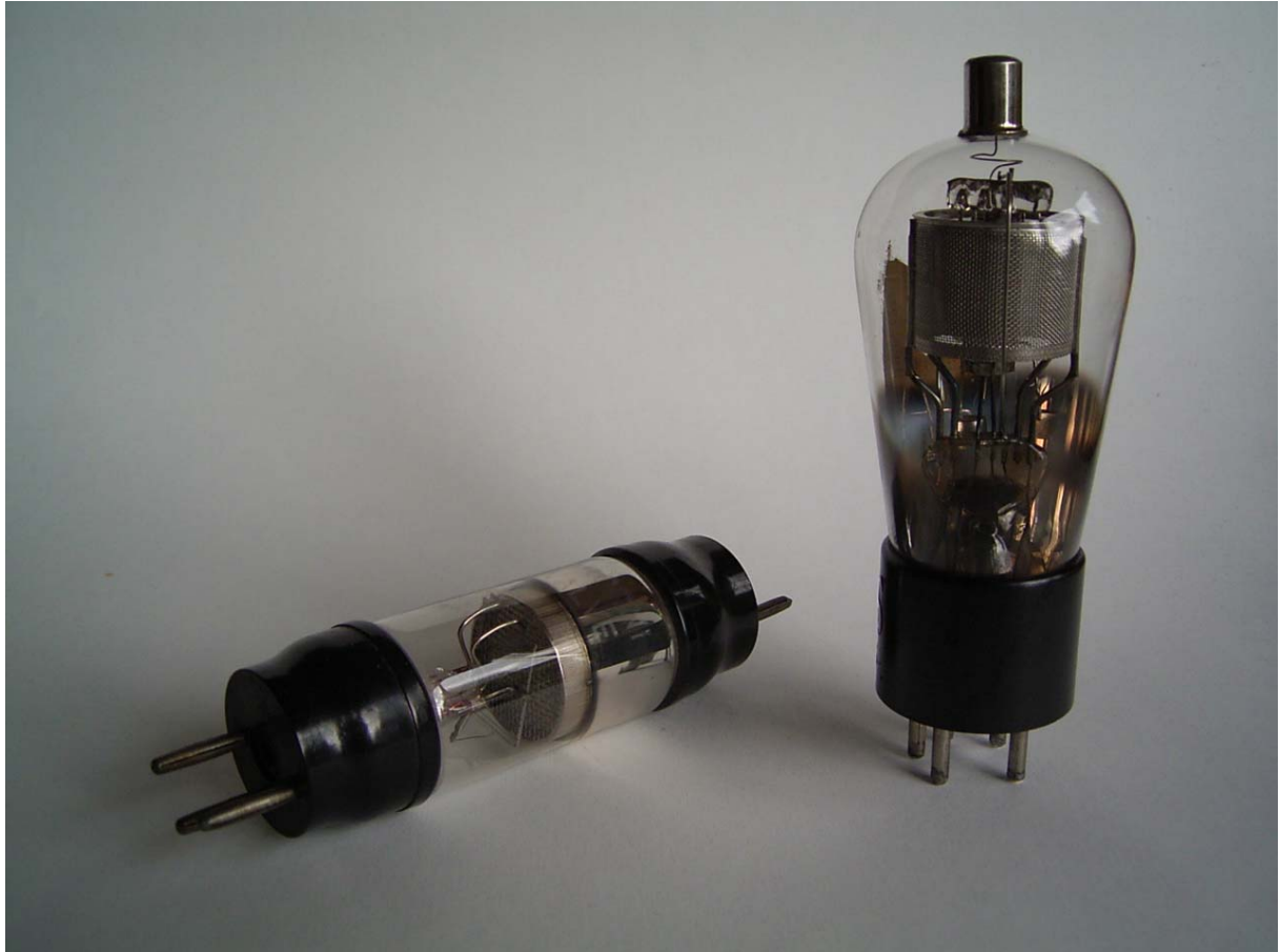
Fig. 8 Screened Valves („Tetrodes“)

Left: Marconi-Osram S 625 (thoriated tungsten filament), right: RCA UY224 (indirectly heated cathode)