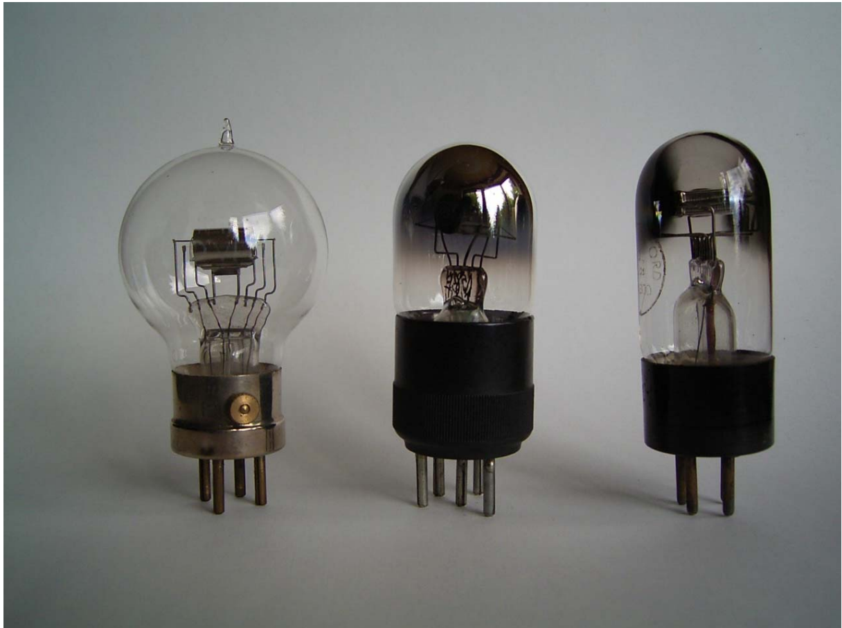
Fig. 13: Space Charge Grid Tubes

Space-charge grid tubes were built with any type of filament and even with indirectly heated cathode. Fig. 143 shows a set of these tubes.