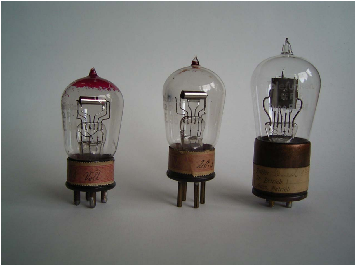
Fig. 14: Tubes with Different Bases

From left to right: R.E.84 (Telefunken base), R.E.95 (British-french base), R.E.48 (UV-base)