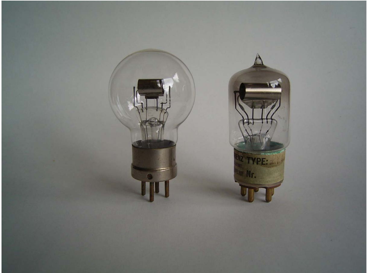
Fig. 6: Early Output Tubes with Tungsten Filament

Even in the early times – that is, in the time of tungsten filament – we find output tubes. Fig. 6 gives two examples.