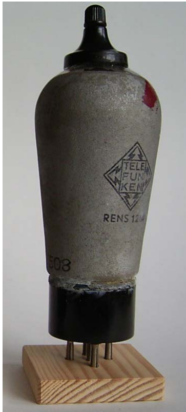
Fig. 9 Tube with electrostatic shielding by Conductive Metal Paint

Left: Marconi-Osram S 625 (thoriated tungsten filament), right: RCA UY224 (indirectly heated cathode)